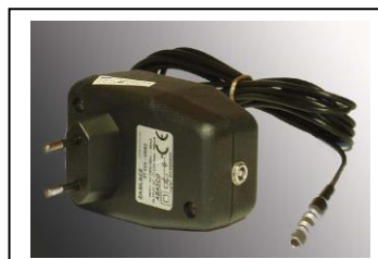
Power supply with LEMO connector