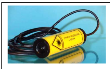
Laser line generator