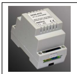
Power supply for TS-35mm bar